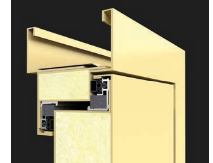
Split frame assembly