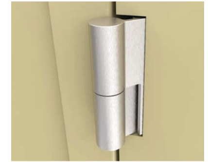
IAC's proprietary cam lift hinge